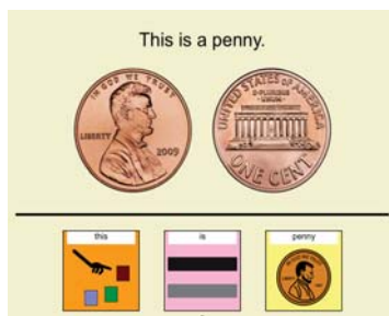
How Much Is It Worth?