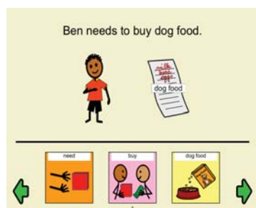
Ben Goes Shopping